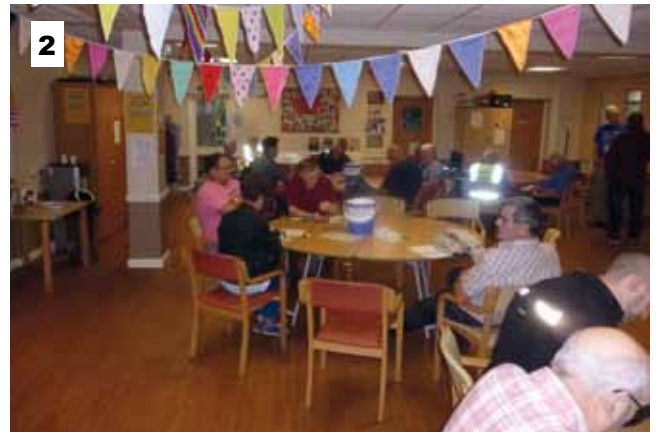
Right: Men reading leaflets and filling in Consent Forms.