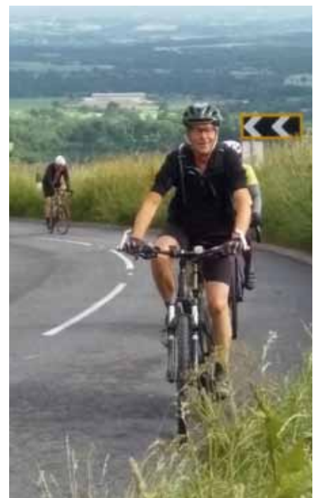
Cycling up Ditchling Beacon

Albion in the Community use and support the Horizon Centre in offering health and fitness training for those in Brighton. As I live in Mid Sussex, I was offered 'Move More', another programme to encourage health and fitness activities. I found this too easy – I am used to lots of off-road cycling on the South Downs, and it was this level that I wanted to achieve