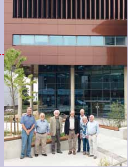
PCaSO members outside the new Centre for Cancer Immunology.

University of Southampton Clinical Trials Unit are trialling new immunotherapy drugs with men whose prostate cancer has become